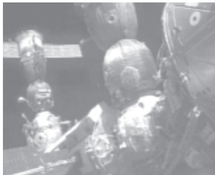
A frame grab shows the Soyuz space craft (L) moments before docking manually with the International Space Station (ISS) on 16 Oct, 2004. The Russian spacecraft delivered three astronauts to the station on Saturday, smoothly overcoming docking system problems which had delayed its launch.