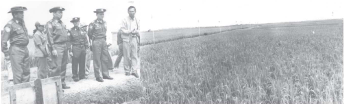
Secretary-2 Lt-Gen Thein Sein inspects cultivation of Shweyinaye paddy in Ingaung Village in Heho Township.—MNA