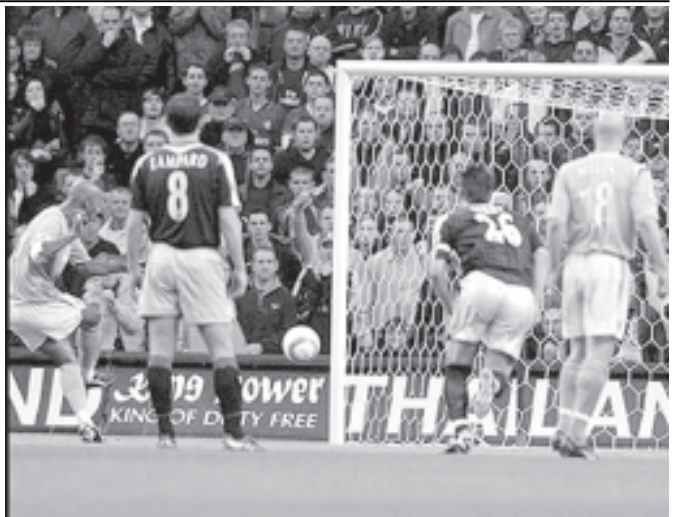
Manchester City's French Nicolas Anelka (L) scores a penalty to make it 1-0 against Chelsea during their Premier League football match at The City of Manchester Stadium on 16 Oct, 2004.

Roma are away to German club Bayer Leverkusen in the Champions League on Tuesday.—MNA/Reuters