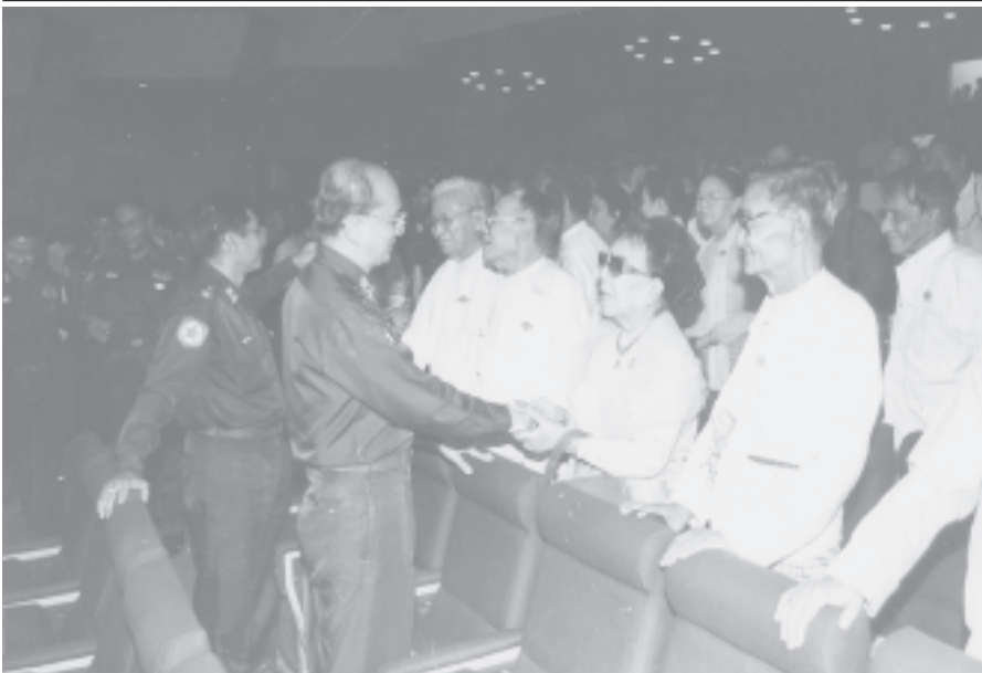
Secretary-1 Lt-Gen Thein Sein greets members of the Panel of Patrons for the 12th Myanmar Traditional Cultural Performing Arts Competitions.