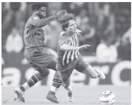
FC Porto's Brazilian Diego Ribas (R) is tackled by Paris St Germain's Modeste M'Bami (L) during their European Champions League clash in Porto.