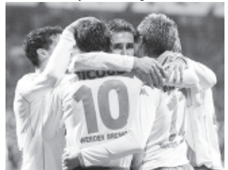
Bremen's striker Miroslav Klose (C) celebrates with his teammates his 3-1 against Anderlecht during their Champions League match in Bremen.

Werder were indeed far superior. Playmaker Johan Micoud directed midfield operations and repeatedly sent in dangerous corners, while Ludovic Magnin threatened down the left all night.