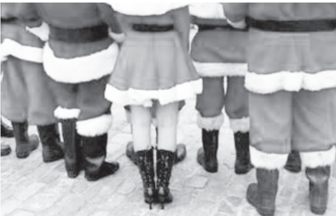
Professional Santa Claus performers attend a training day at the 'Ministry of Fun's Santa School' at Southwark Cathedral in London, on 1 Nov, 2004. The 'Ministry of Fun,' which provides Santa Claus performers for Christmas grottos, hosted the event for 35 Santas on Monday, with the aim of highlighting and turning around what they claim is a decline in demand for their services during the festive period.